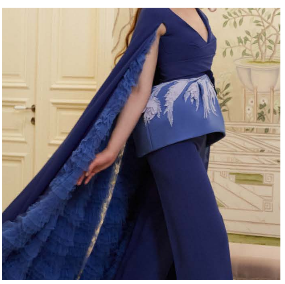
MER DU NORD