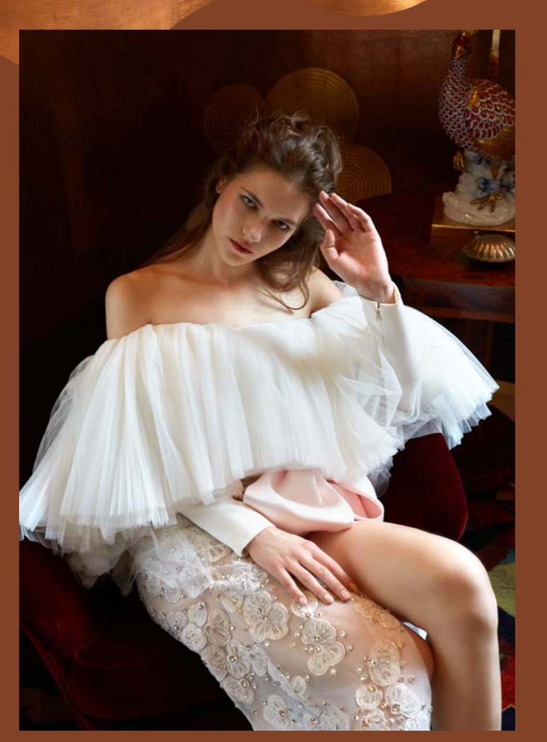
FLEUR DE LAC