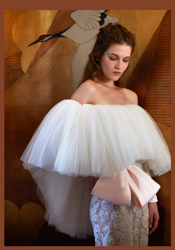
FLEUR DE LAC