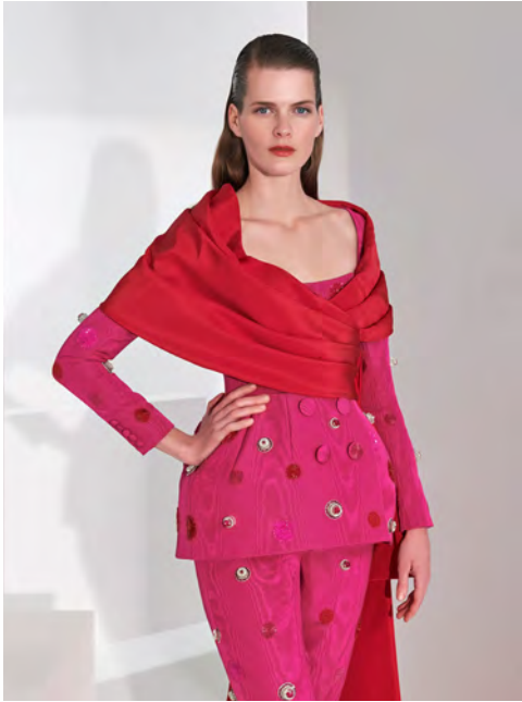
13. SUMMER WINE