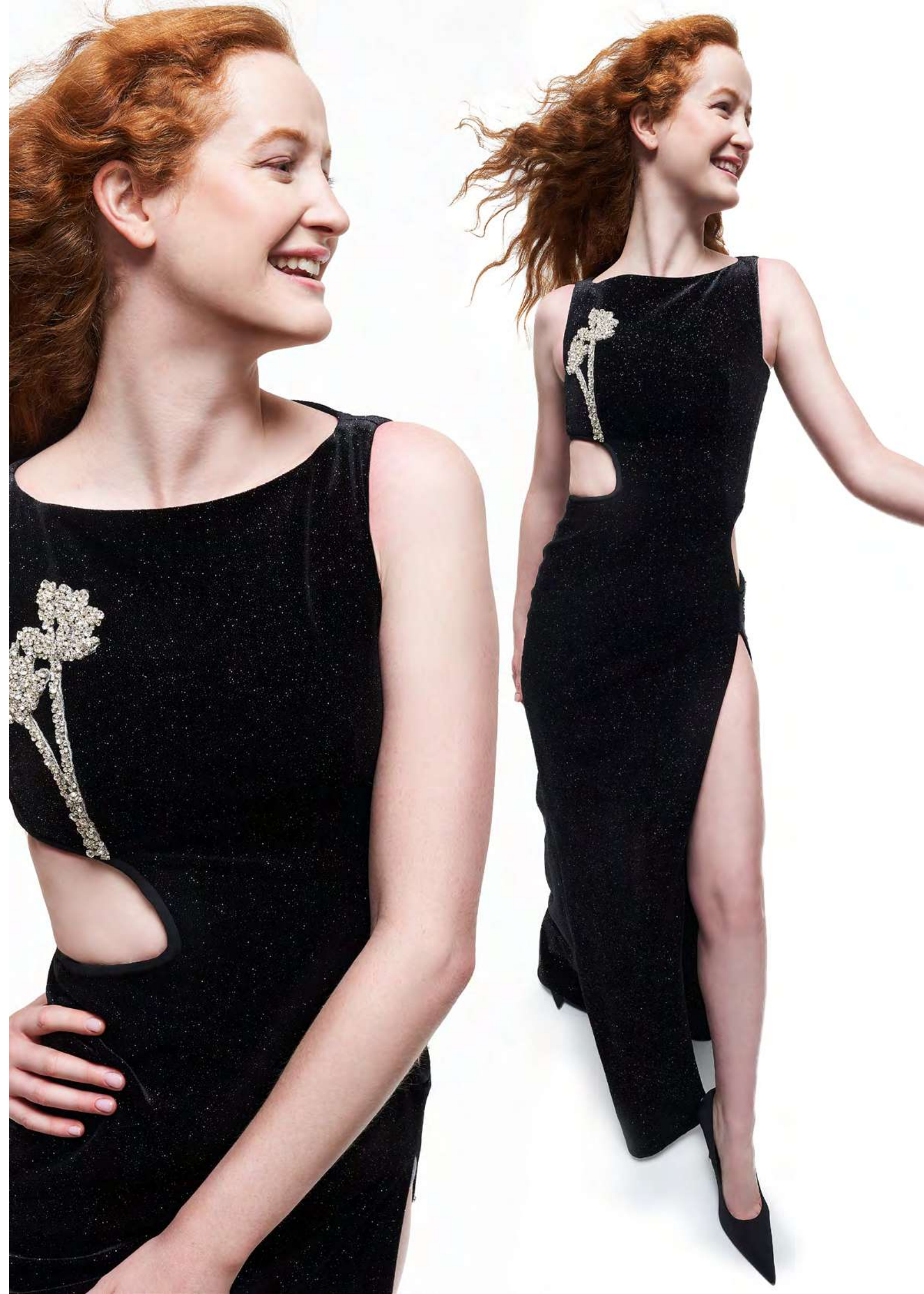
LONG DRESS - 048S823