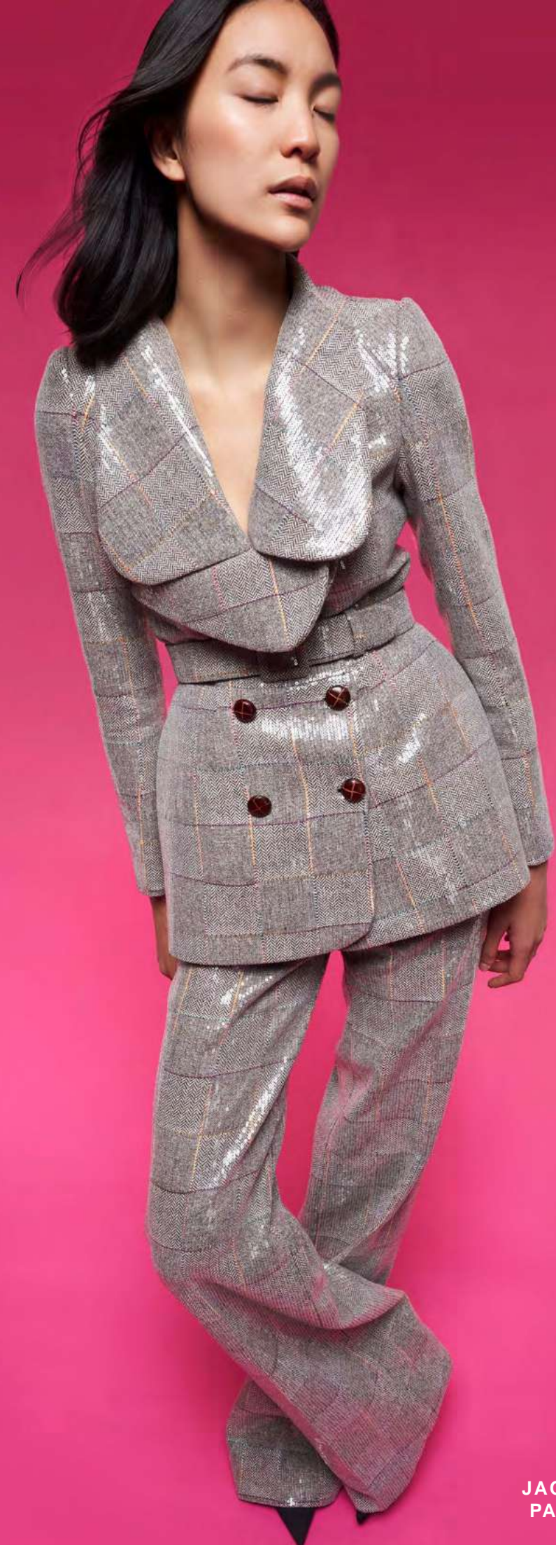
JACKET - 024S823 PANTS - 025S823