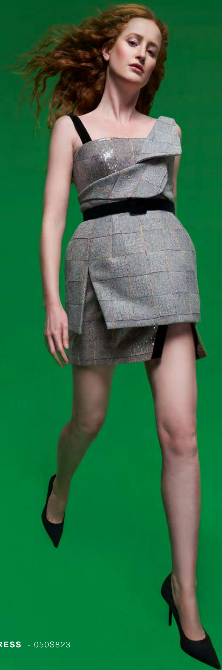
SHORT DRESS - 050S823