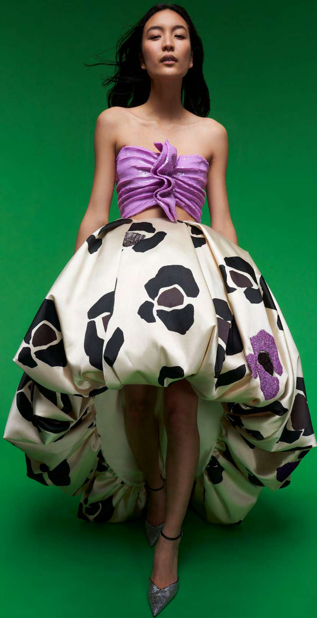
SHORT DRESS - 038S823