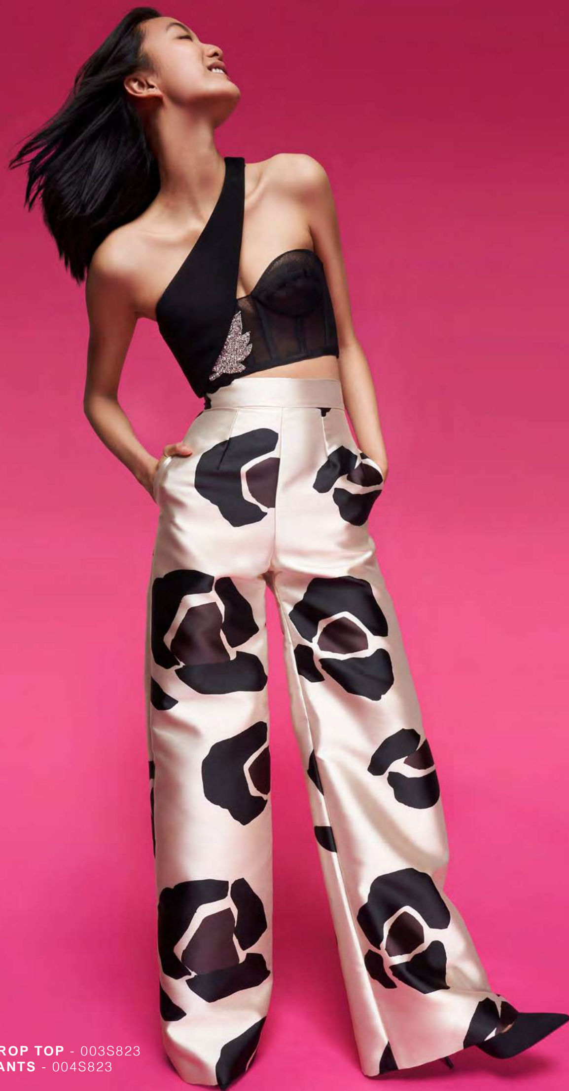
CROP TOP - 003S823 PANTS - 004S823