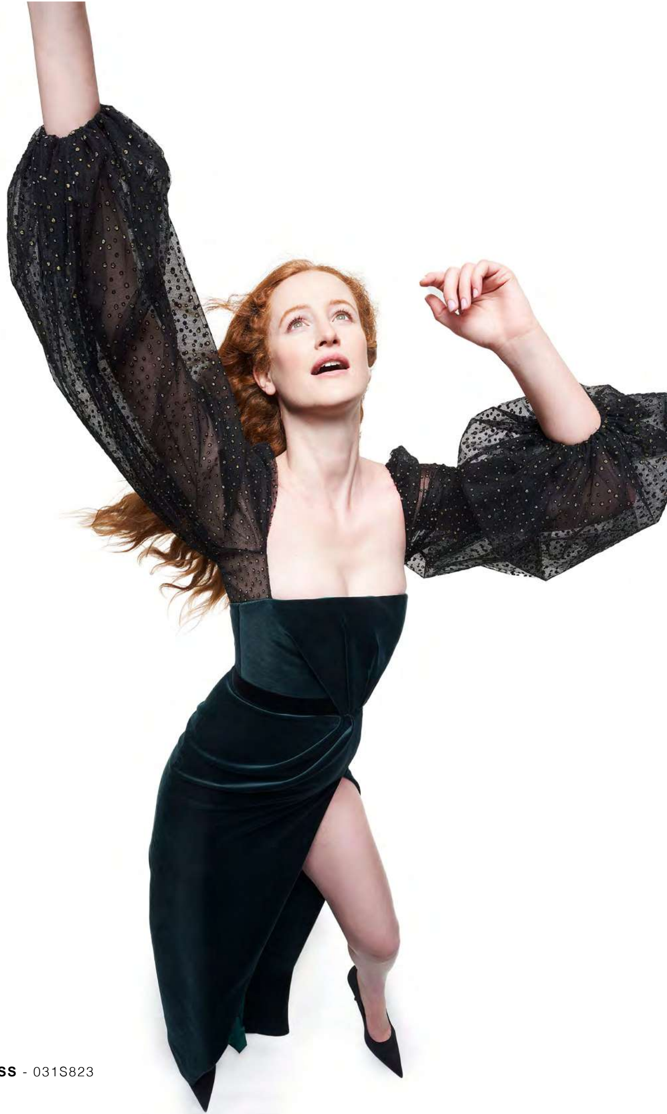
LONG DRESS - 031S823