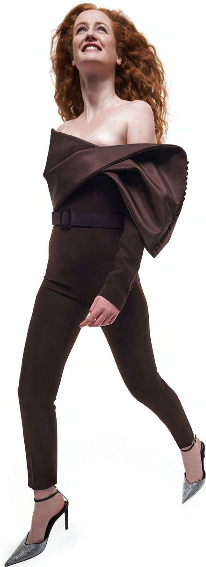
JUMPSUIT - 035S823