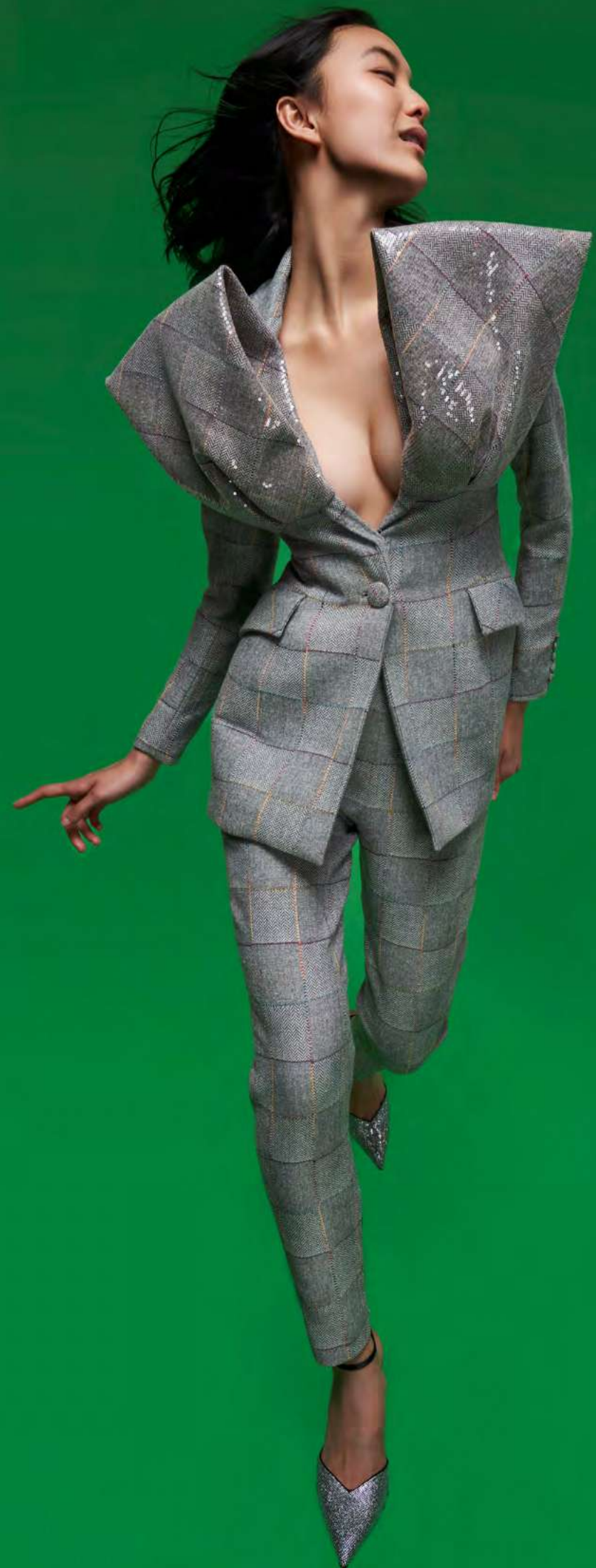
JACKET - 017S823 PANTS - 018S823