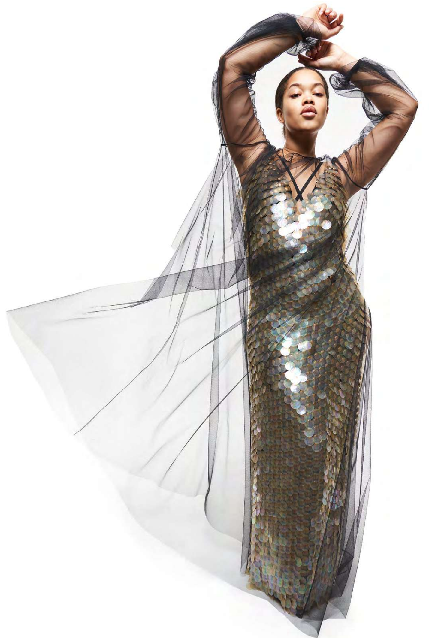
LONG DRESS & CAPE - 036S823