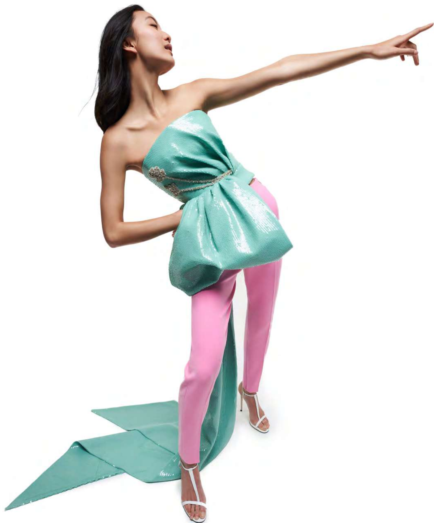
TOP - 022S823 PANTS - 012S823