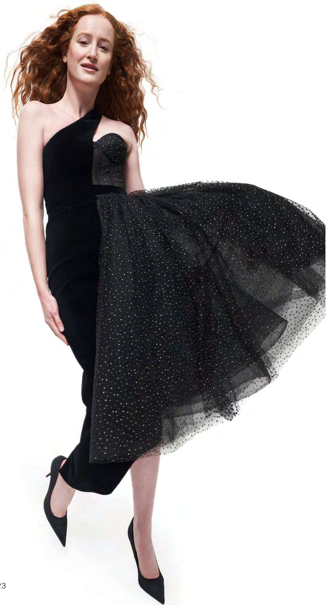
MIDIDRESS - 029S823