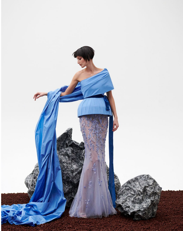
15. BLEU DE NEPTUNE