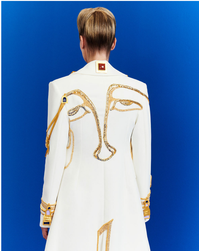
1. GILDED REVERIE