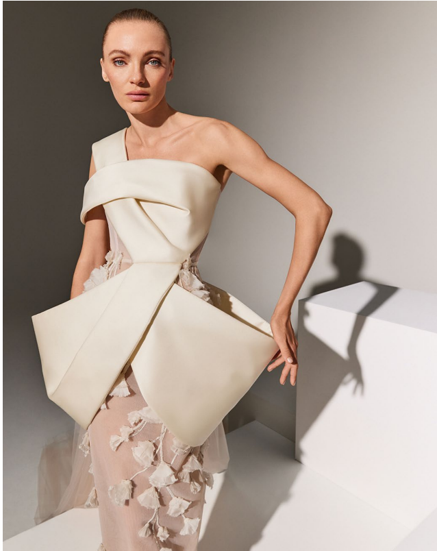
7. ROUQUET RENVERSE