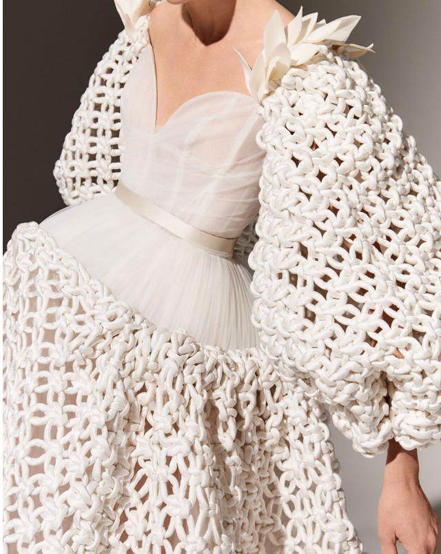
4. CASA BLANCA