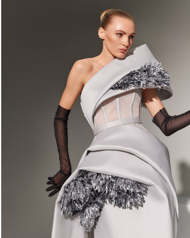
11. SILVER GARDEN