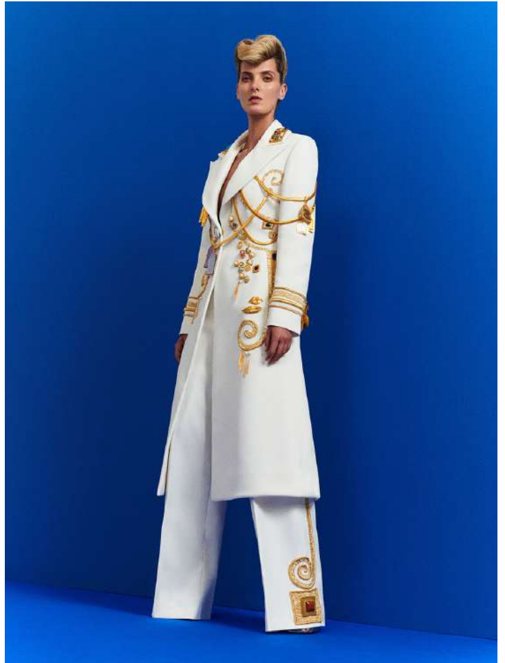
1. GILDED REVERIE