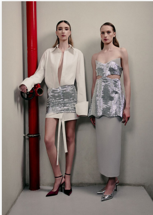
LEFT . SHIRT DRESS.006AW25 RIGHT . MIDI DRESS.007AW25