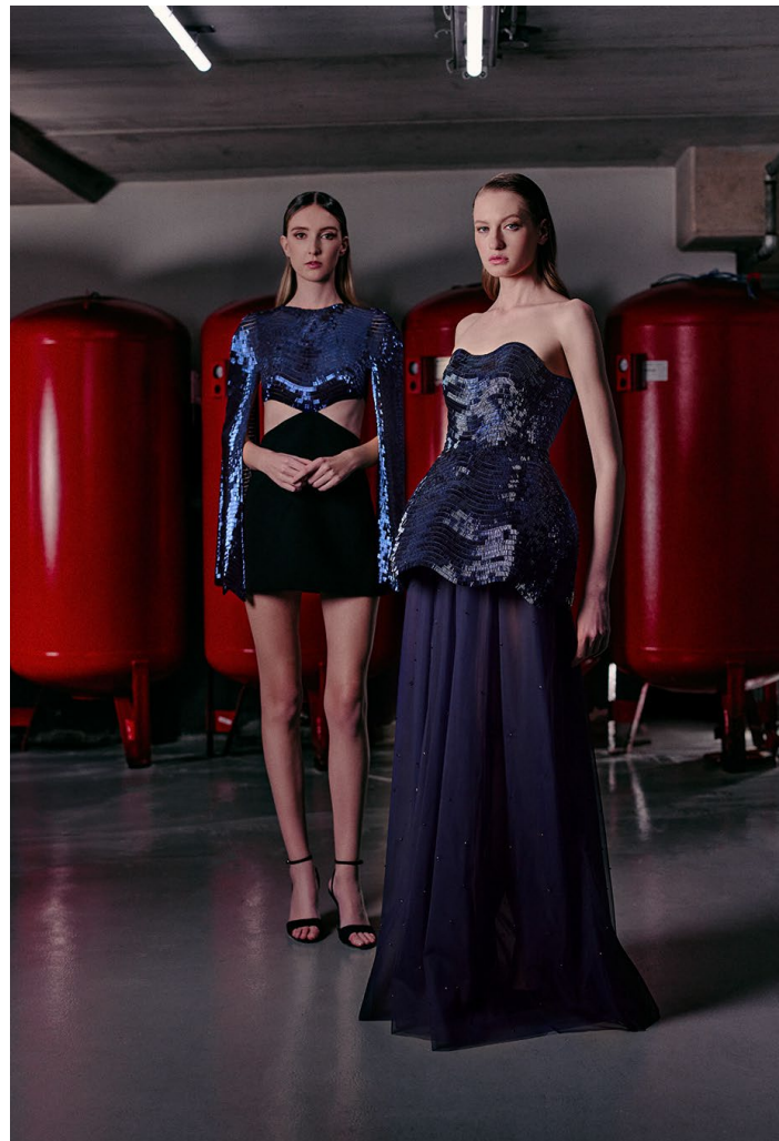
LEFT . LONG DRESS.026AW25 RIGHT . SHORT DRESS.027AW25