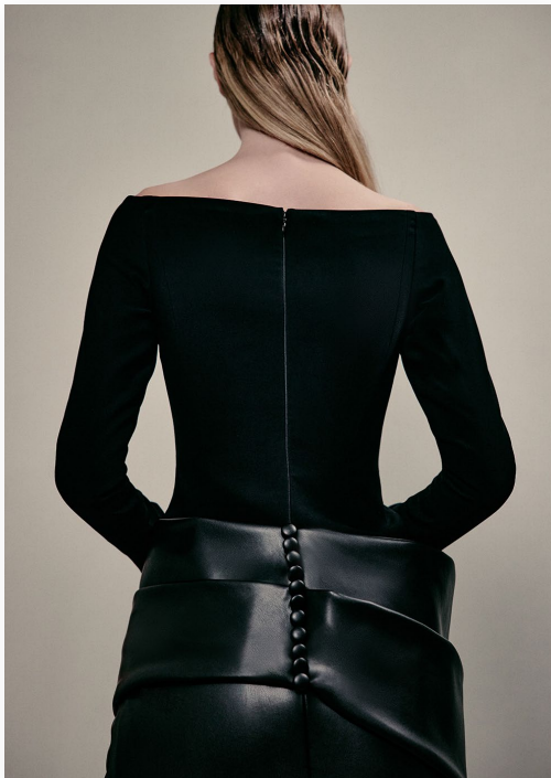
LEFT . LONG DRESS.023SW25