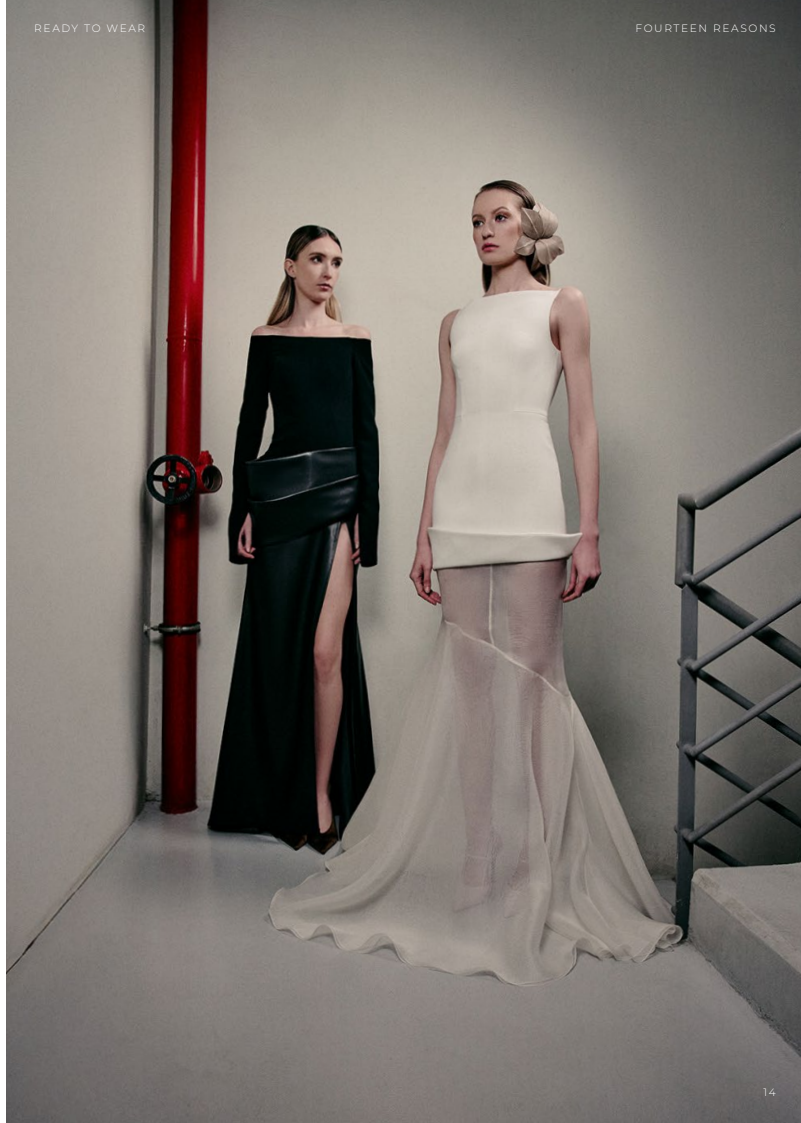
RIGHT . LONG DRESS.024AW25