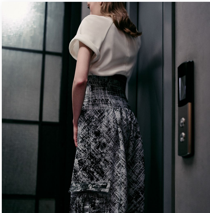
TOP.002AW25 . PANTS.003AW25