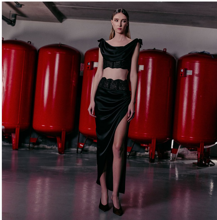
LEFT . TOP.010AW25 . LONG SKIRT.011AW25 RIGHT . SHORT DRESS.009AW25